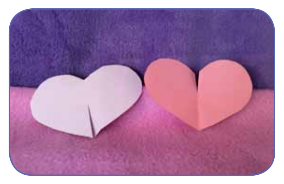
Make a cut down the middle of each heart, but only half way. One from the top down, and the other from the bottom up.