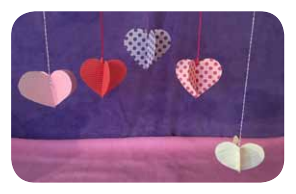
When the glue is dry, you can open the hearts and make them blossom.