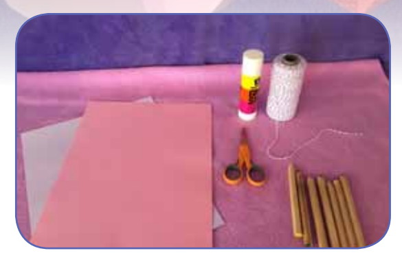
Supplies: colored paper (cardstock works best), scissors, glue, string, and colored pencils if you want to color white paper.