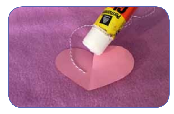
Cut a string as long as you like. Put a little bit of glue in the top center of one heart.